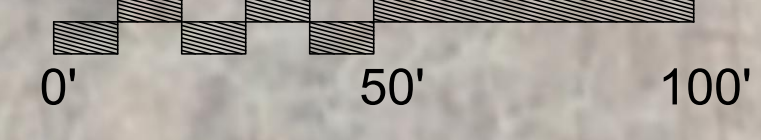
1 Site Plan Scale 1" = 30'