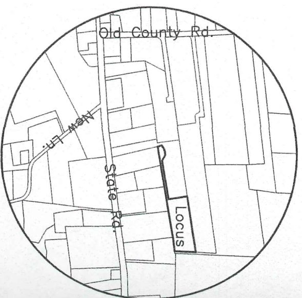
LOCUS MAP Scale: 1" = 1000'