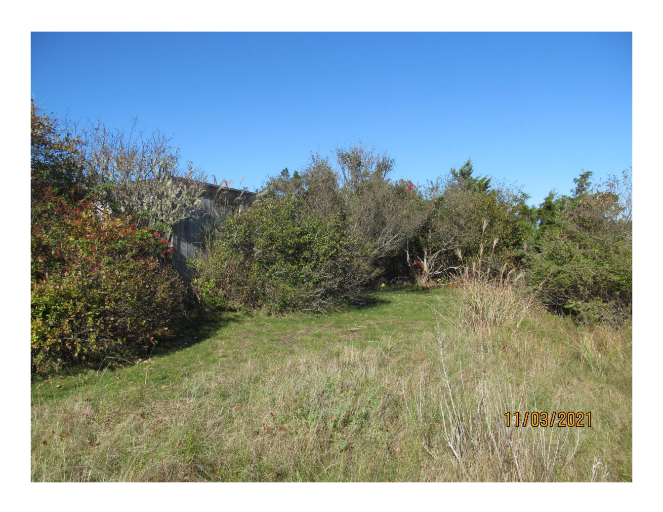
Area of Russian Olives flagged to be removed