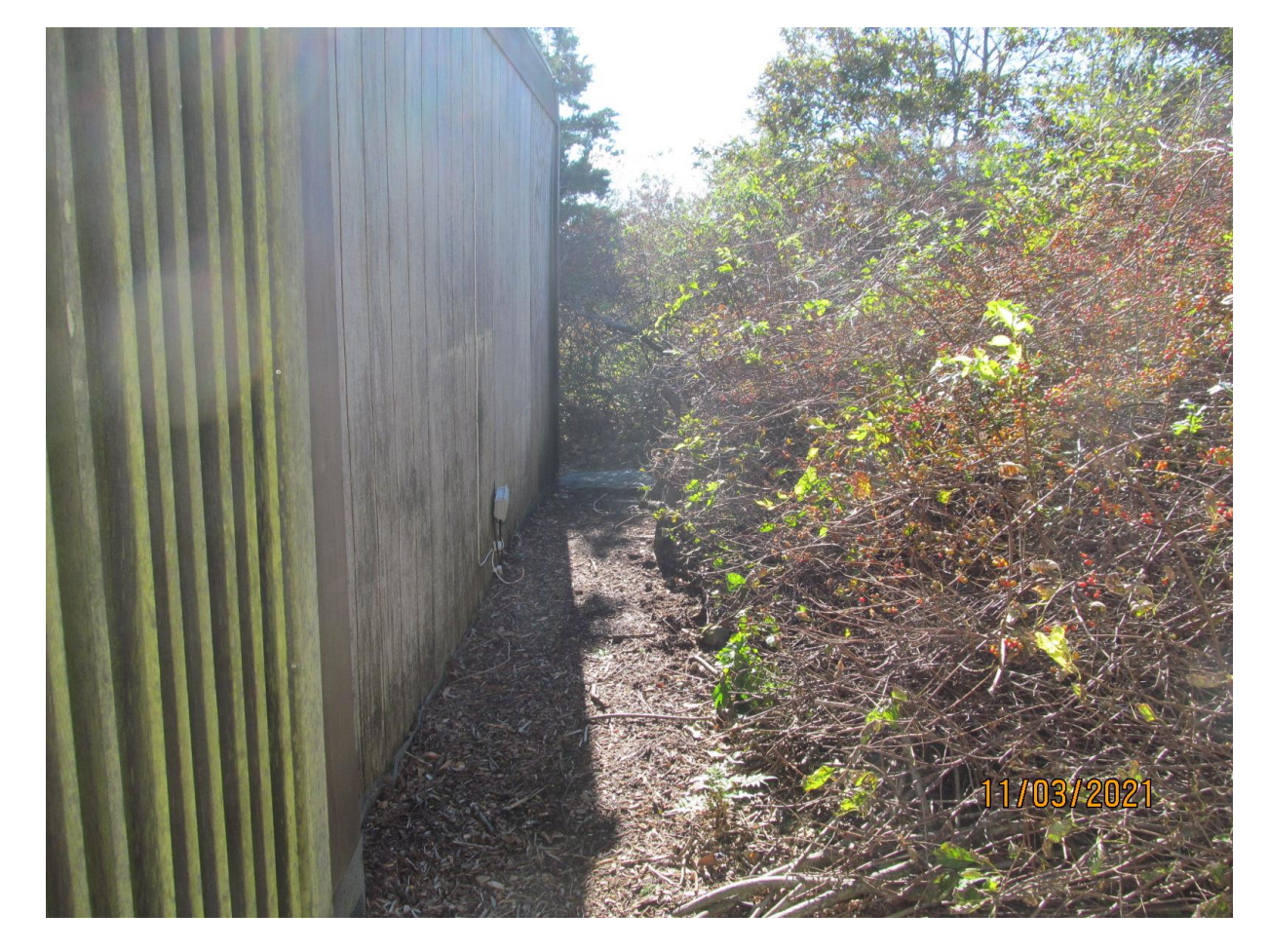
Area of bittersweet staked by Michael to be cut back for construction access