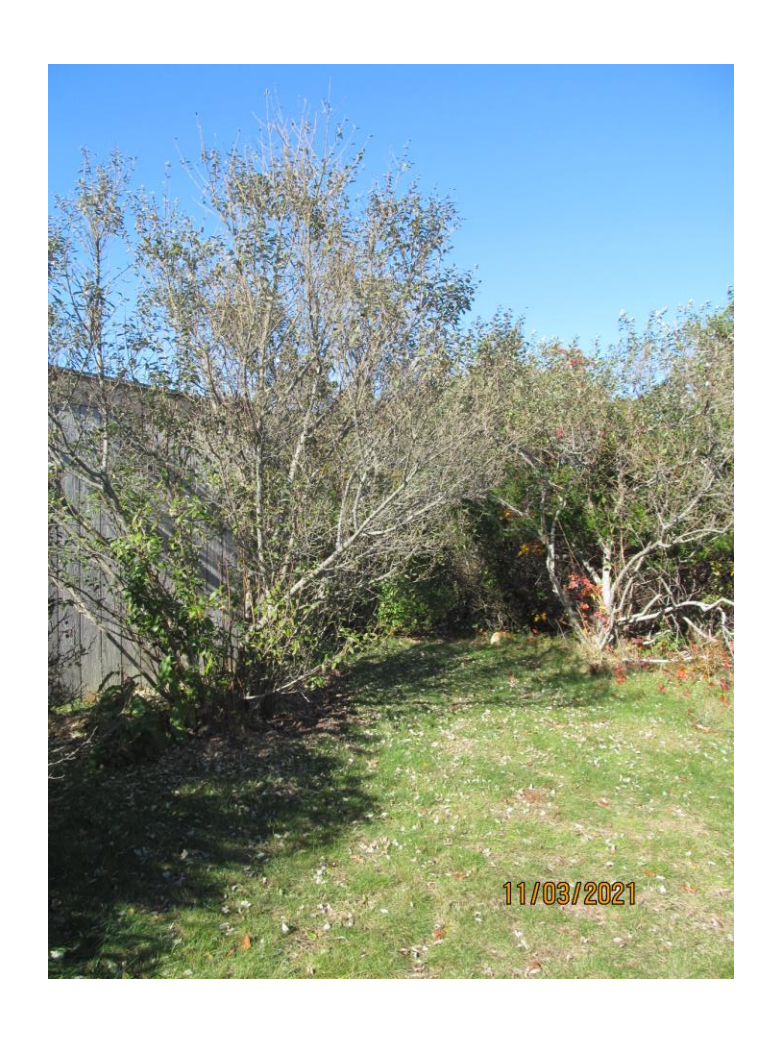
Russian Olives flagged for removal