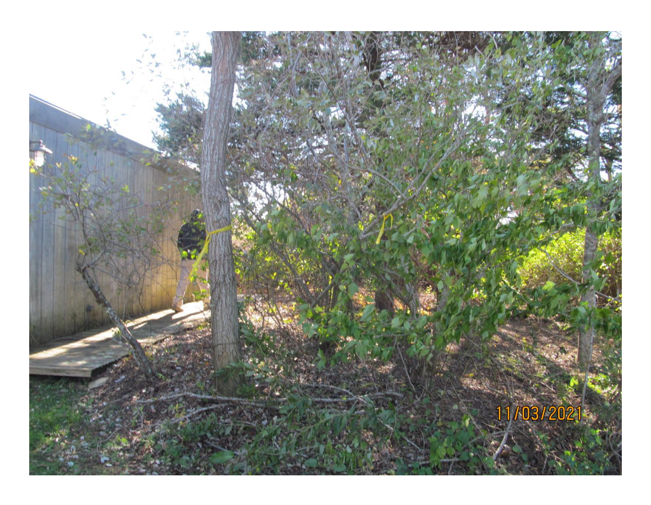
Trees near parking area to be removed for construction acces.