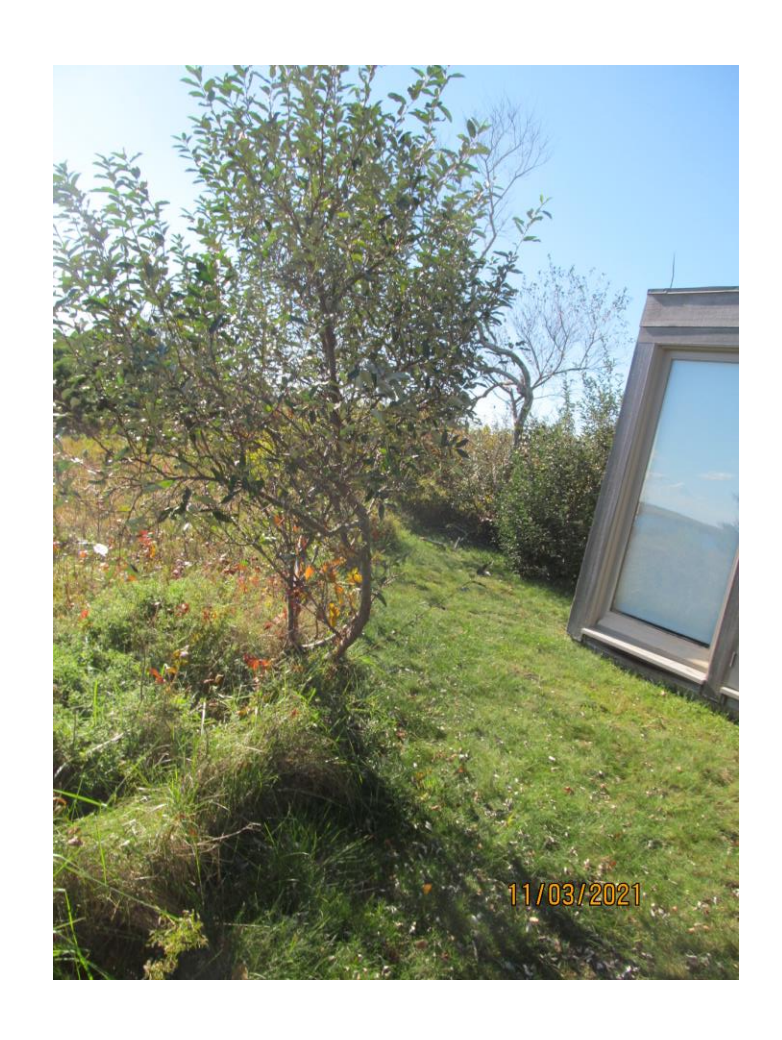
Russian Olive to be removed