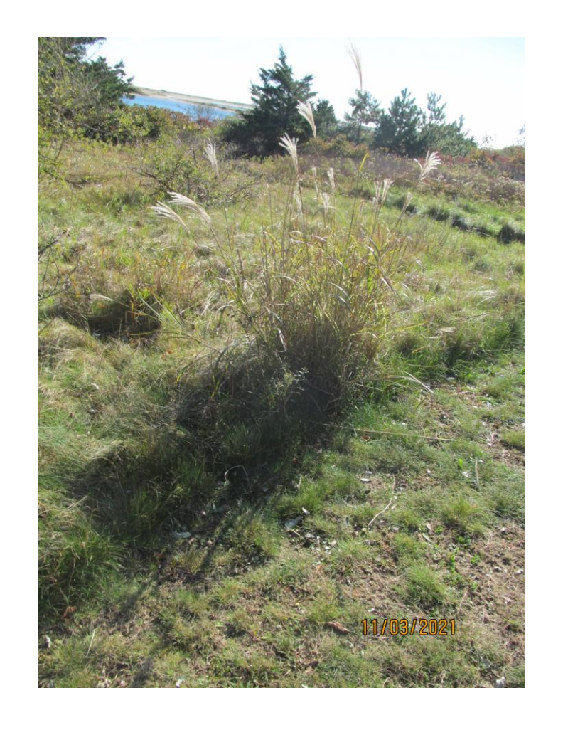
Invasive grass to be removed per Michael.