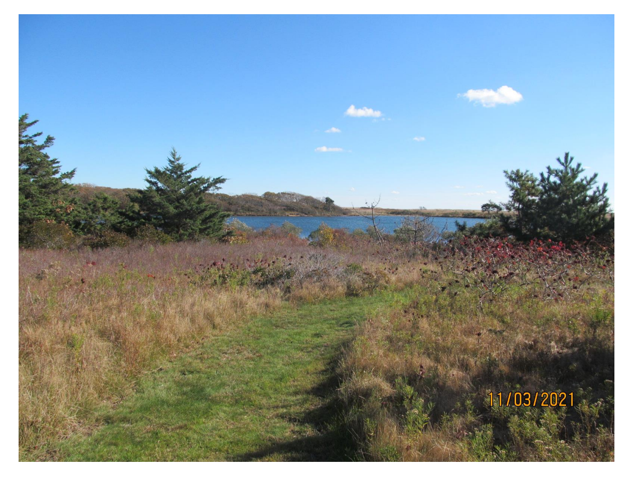
View from compound. Roof deck on building 3 to be added will have this view.