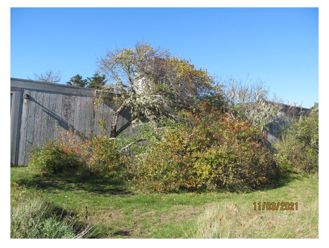
Area at back of house that may need to be dealt with for construction access.