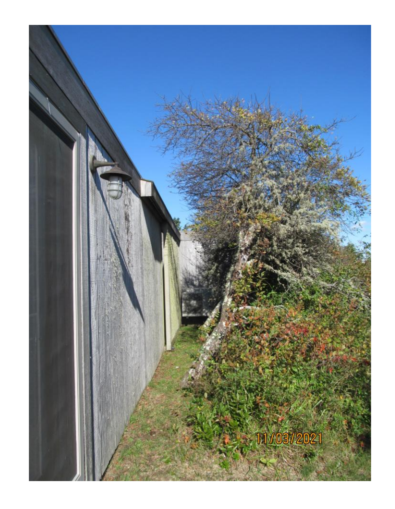
Almost dead tree to be removed..