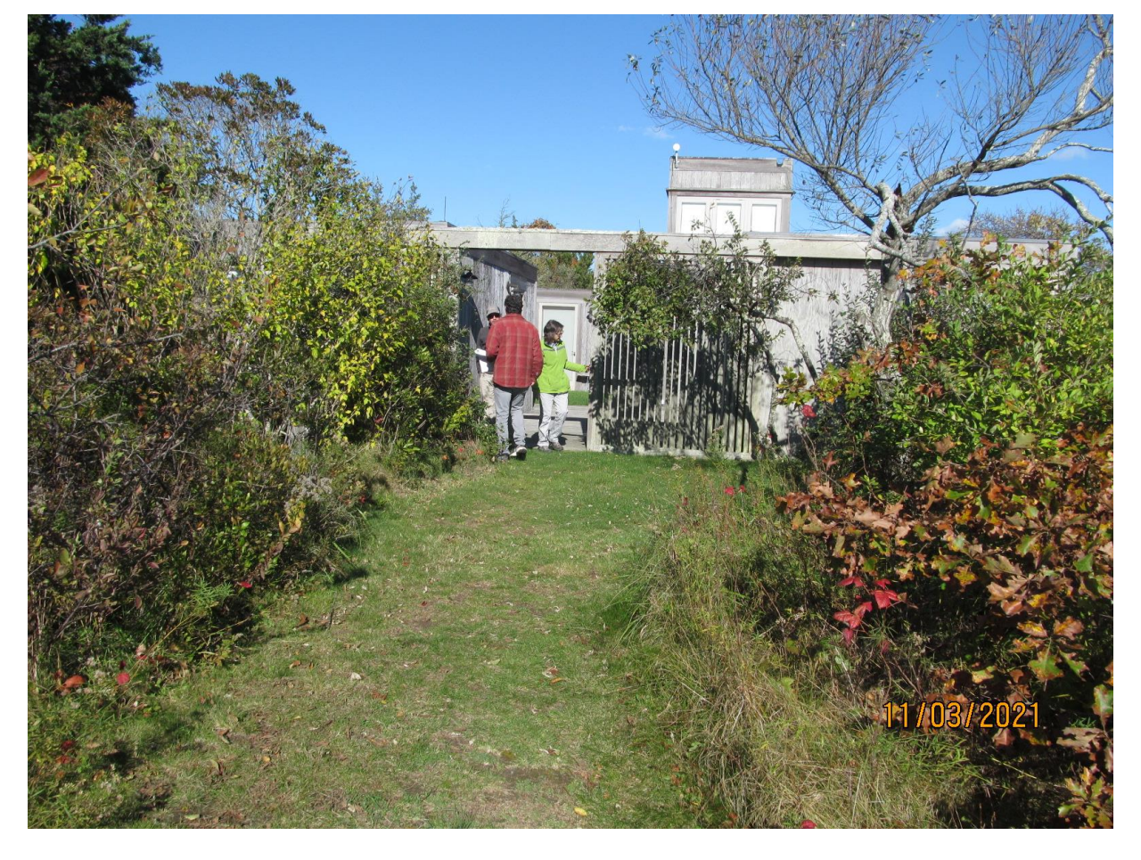
Path to cove. Limit of work fence will block use of the path during construction