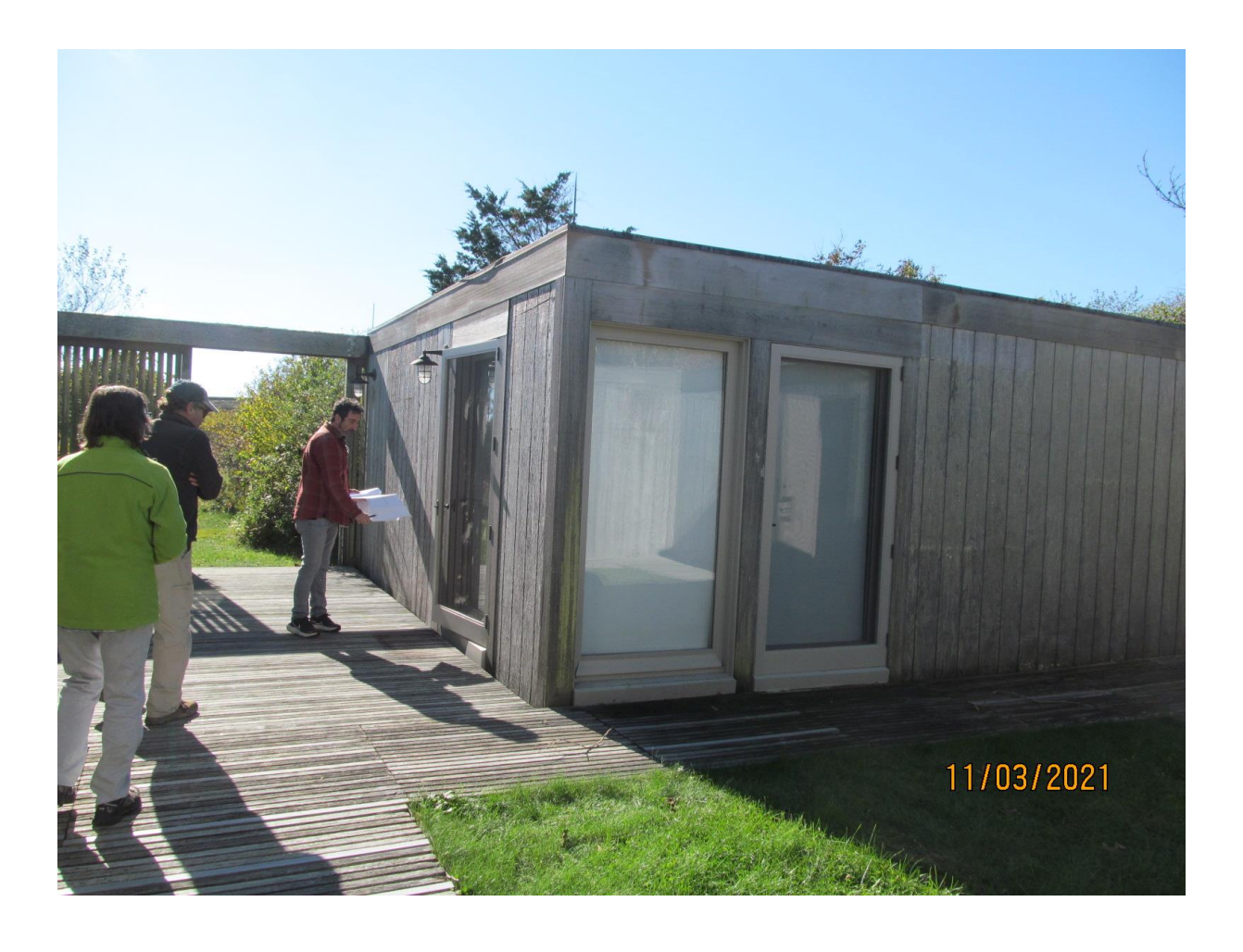
Building 1. To be demolished and rebuilt due to mold problem.