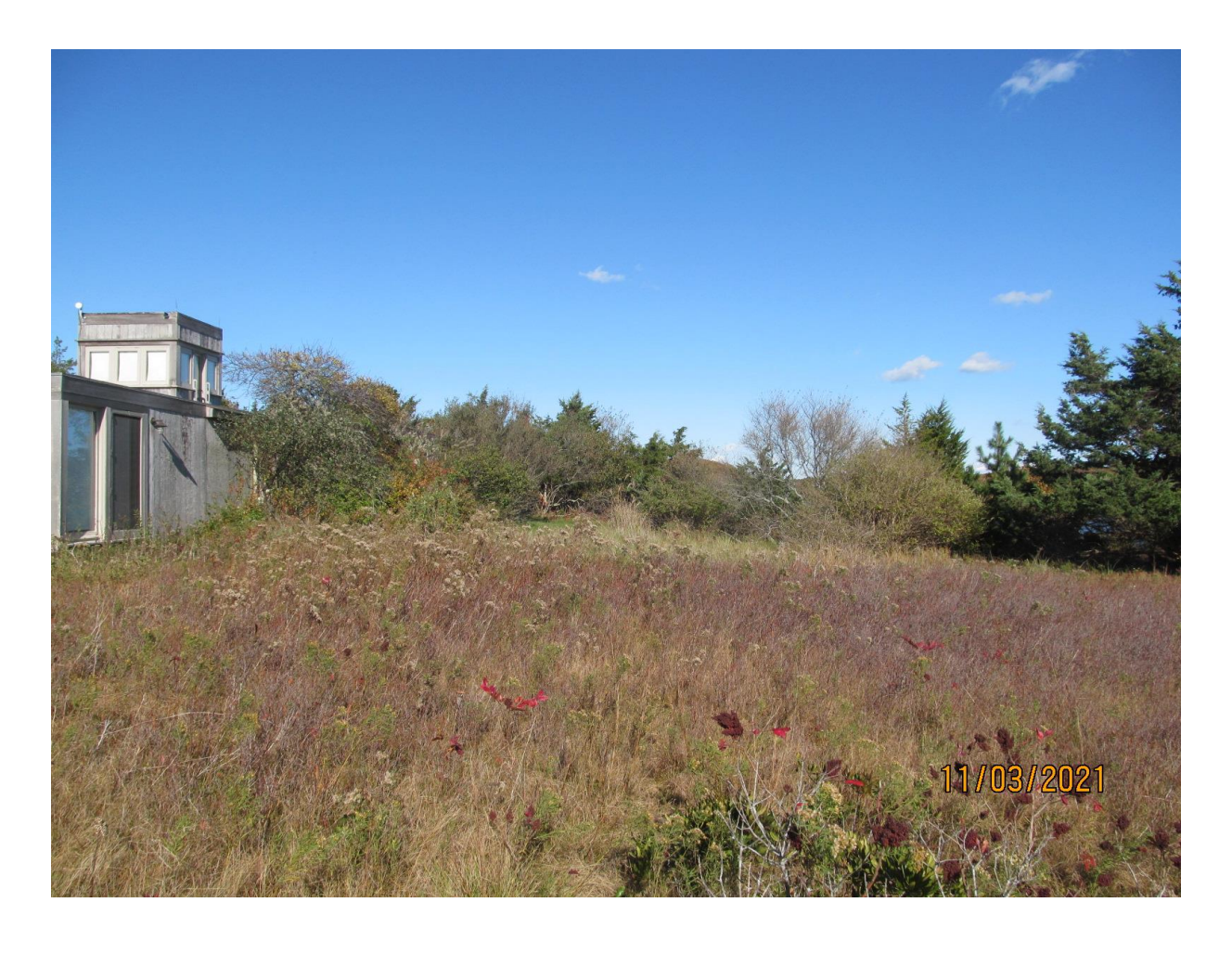
Meadow. Roof deck will go on this building