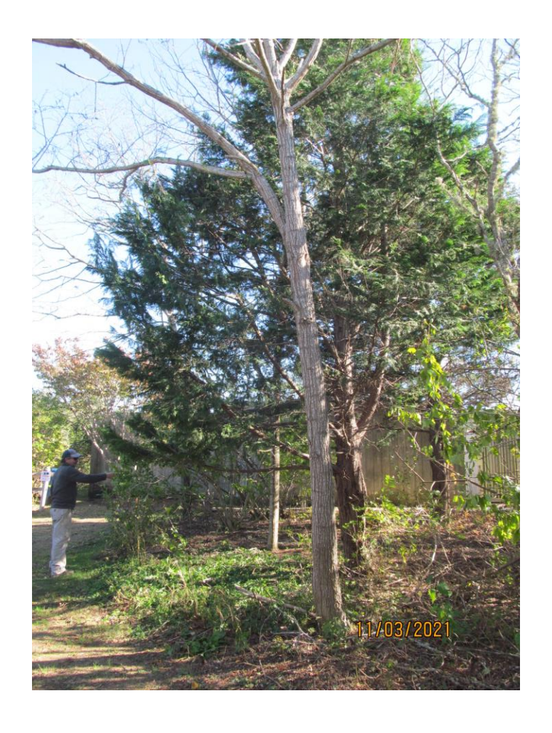
Trees in parking area to be removed for construction access.