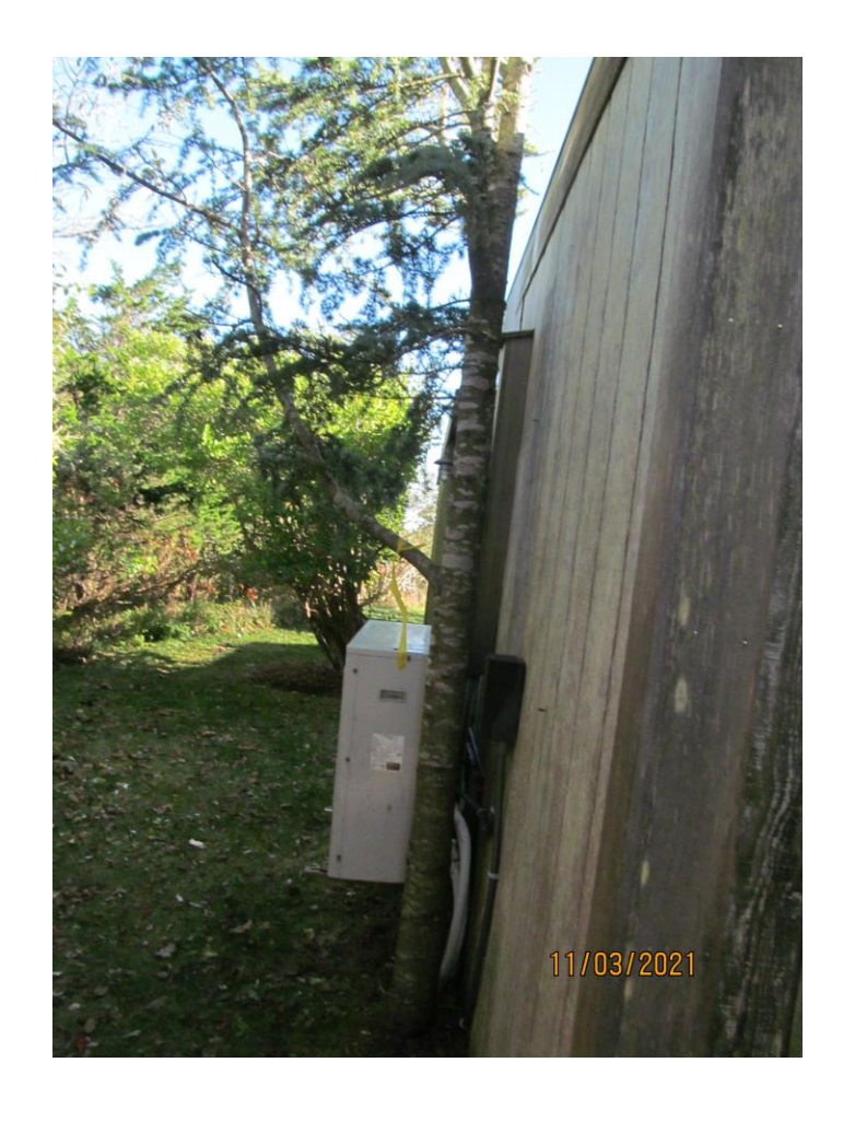
Invasive grass to be removed per Michael.