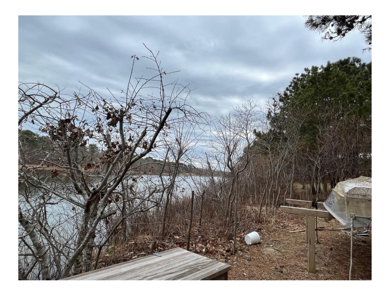
Pruning has been done but shrubs are still about 5 ft.