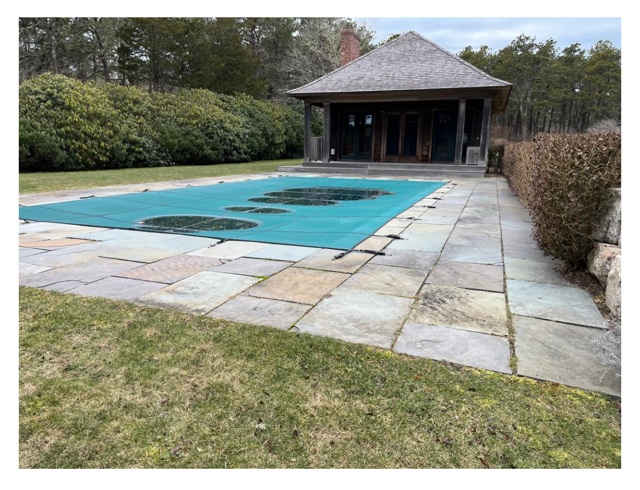
Pool to be reconstructed and lengthened by 5 ft. When constructed none of this was within CC jurisdiction.