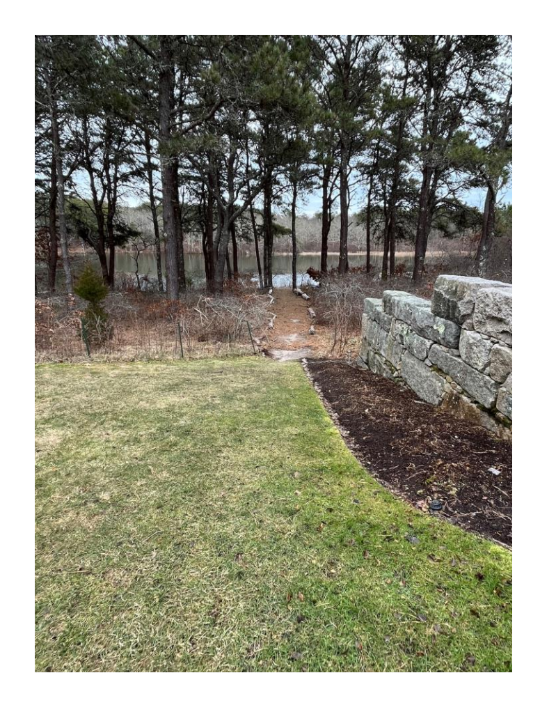
Path to the pond