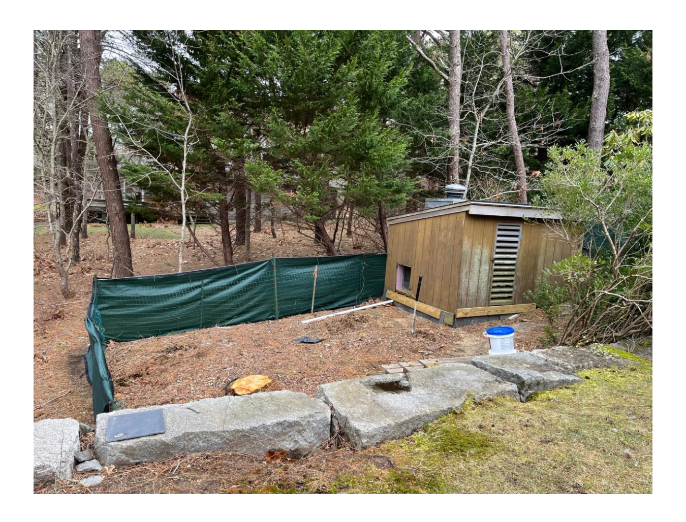
Shed is being relocated outside the BZ.