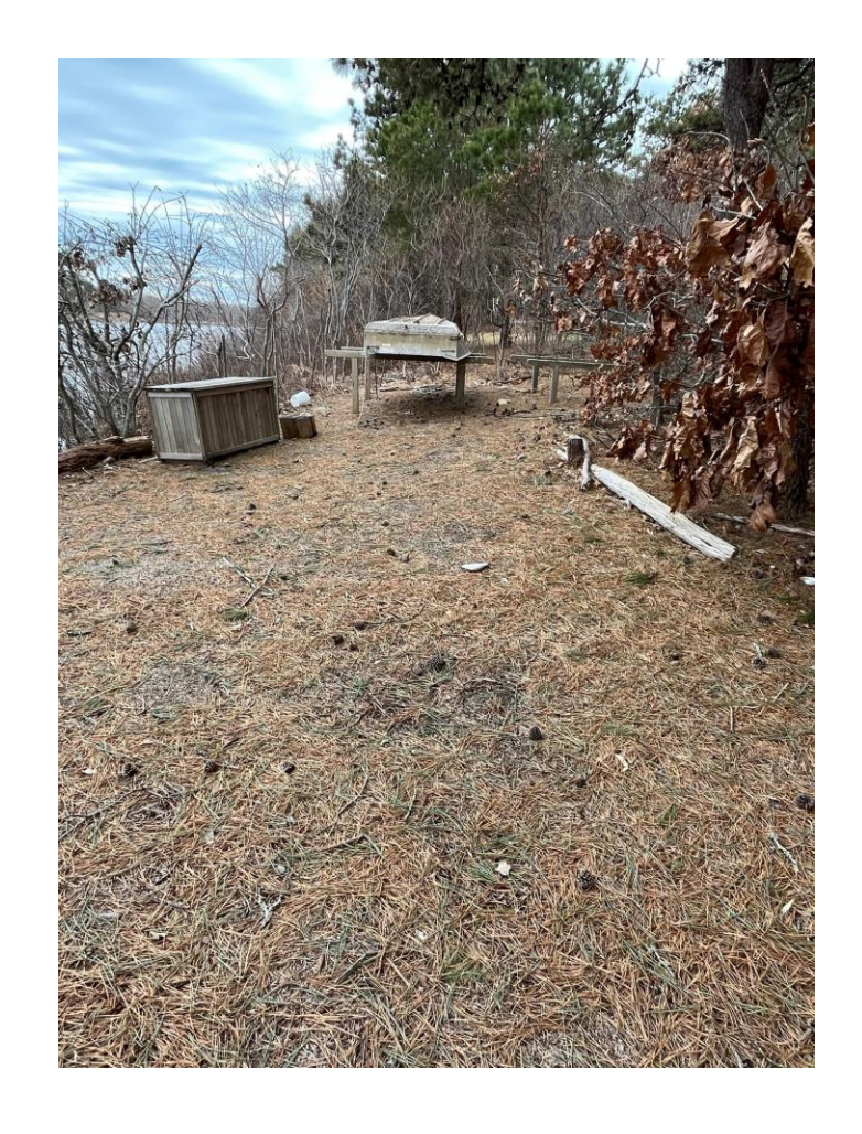
Boat storage. Good that it is elevated.