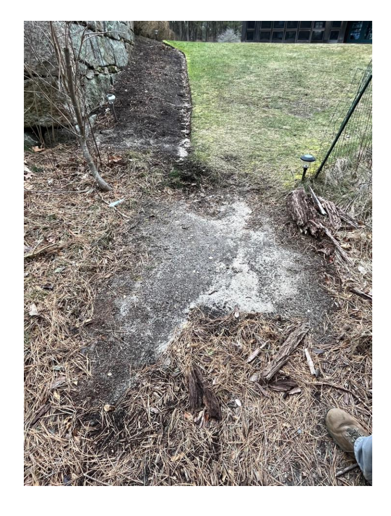
Minor erosion at the end of of the lawn onto the path