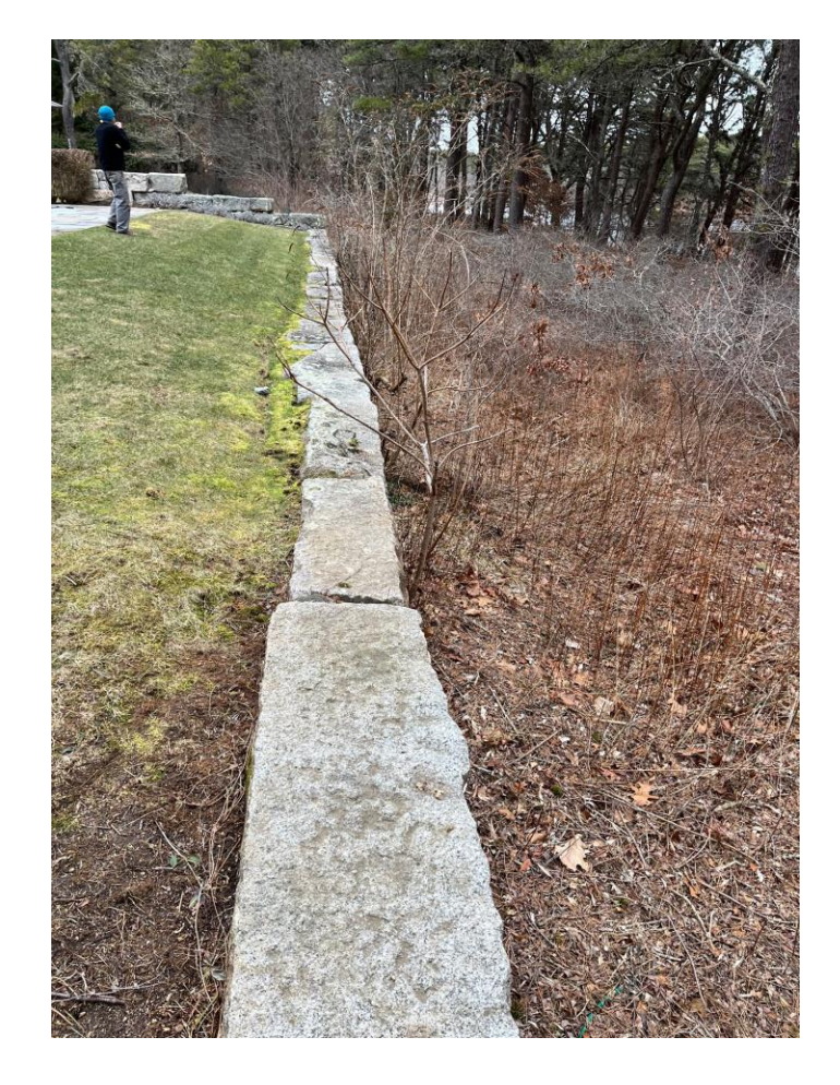
Stone retaining wall along the end of the pool on the pond side.