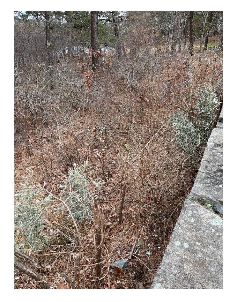
Bamboo plants and some Buddleia. Bamboo should be removed. Not sure about the Buddleia.