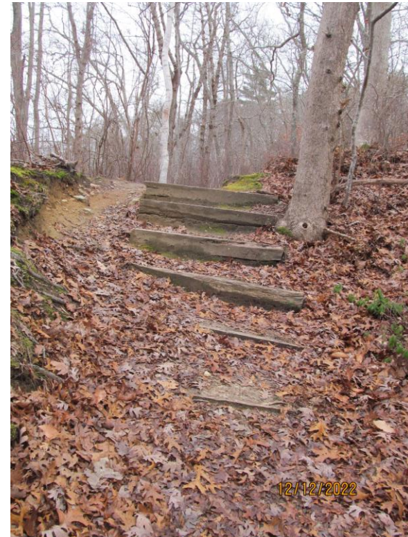
End of causeway crossing and 5 earthen stairs.