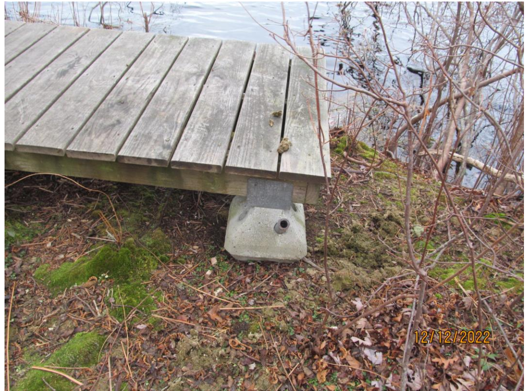
View platform # 2 ( noted as 3 on exhibit A.