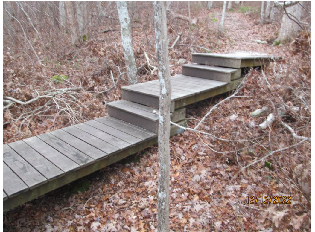
View platform # 1