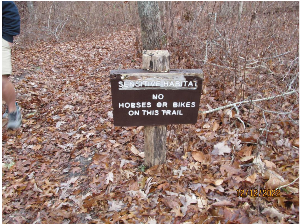
Start of Blackwater Pond