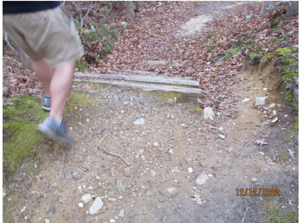
Side erosion most likely caused by mountain bikers