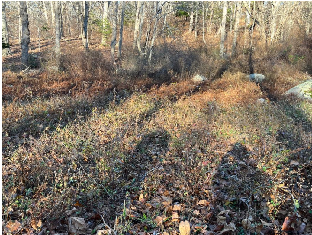
Wetland ( dry at the moment)