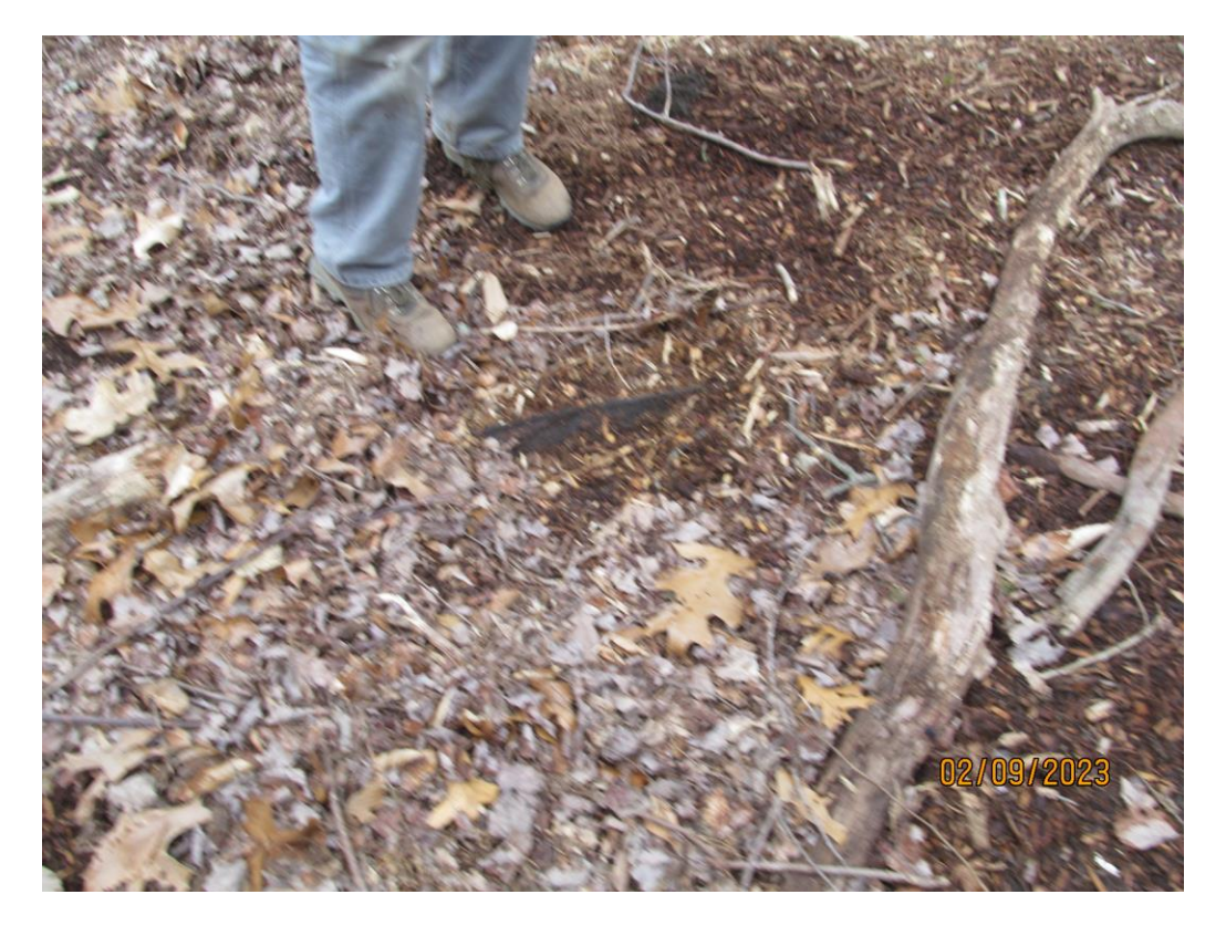
Photo on left is looking to abutter's property. Not sure if they are the ones that took the videos.