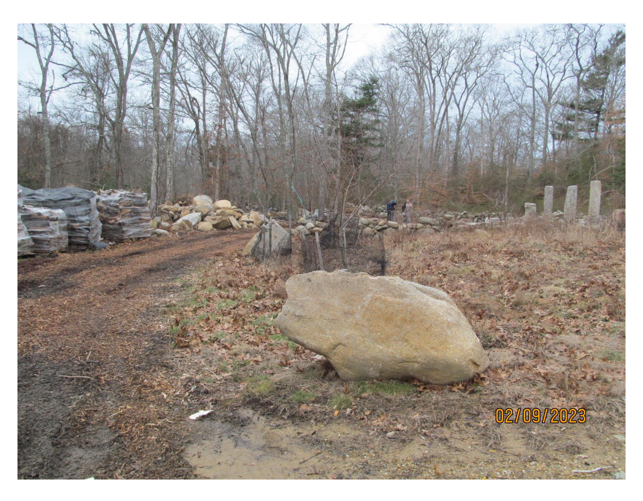
Road left of the boulder is new. May be in the last 10 ft of BZ Needs to be added to survey.