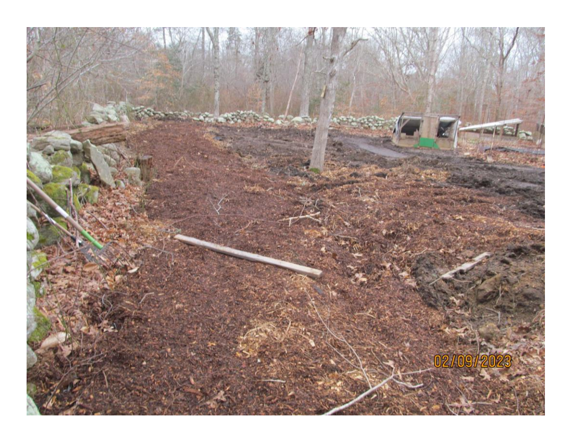
Taken from the new area of alteration towards the garden and woodchipped area shown on the 8/2020 plan