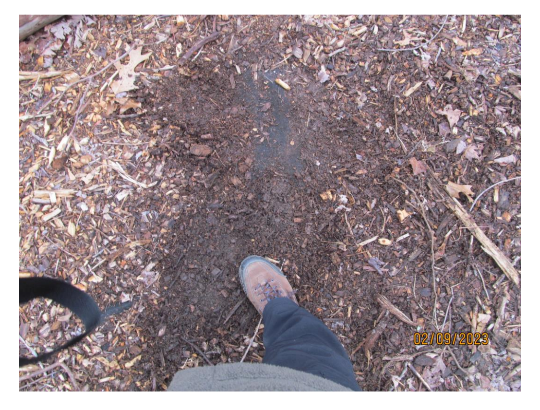
Clear indication of alteration that has been covered with top soil, woodchips and branches. Filter fabic can be seen.