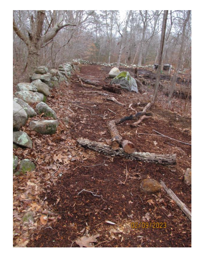
New alteration along the southern boundary line. Need to know if this is within the BZ.