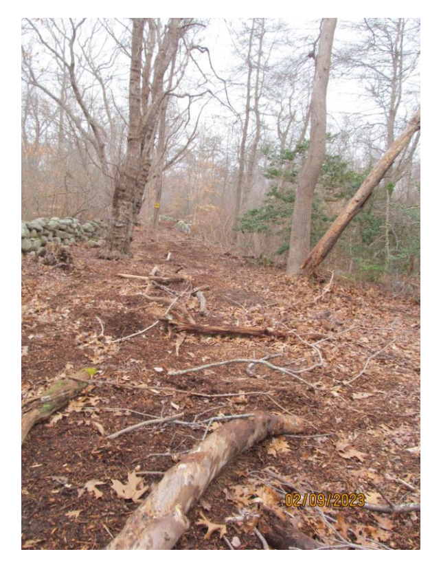
Grading rake in the woods. New road along stone wall at the back of the lot on the south end of the property. Abuting Map 15 Lot 24.