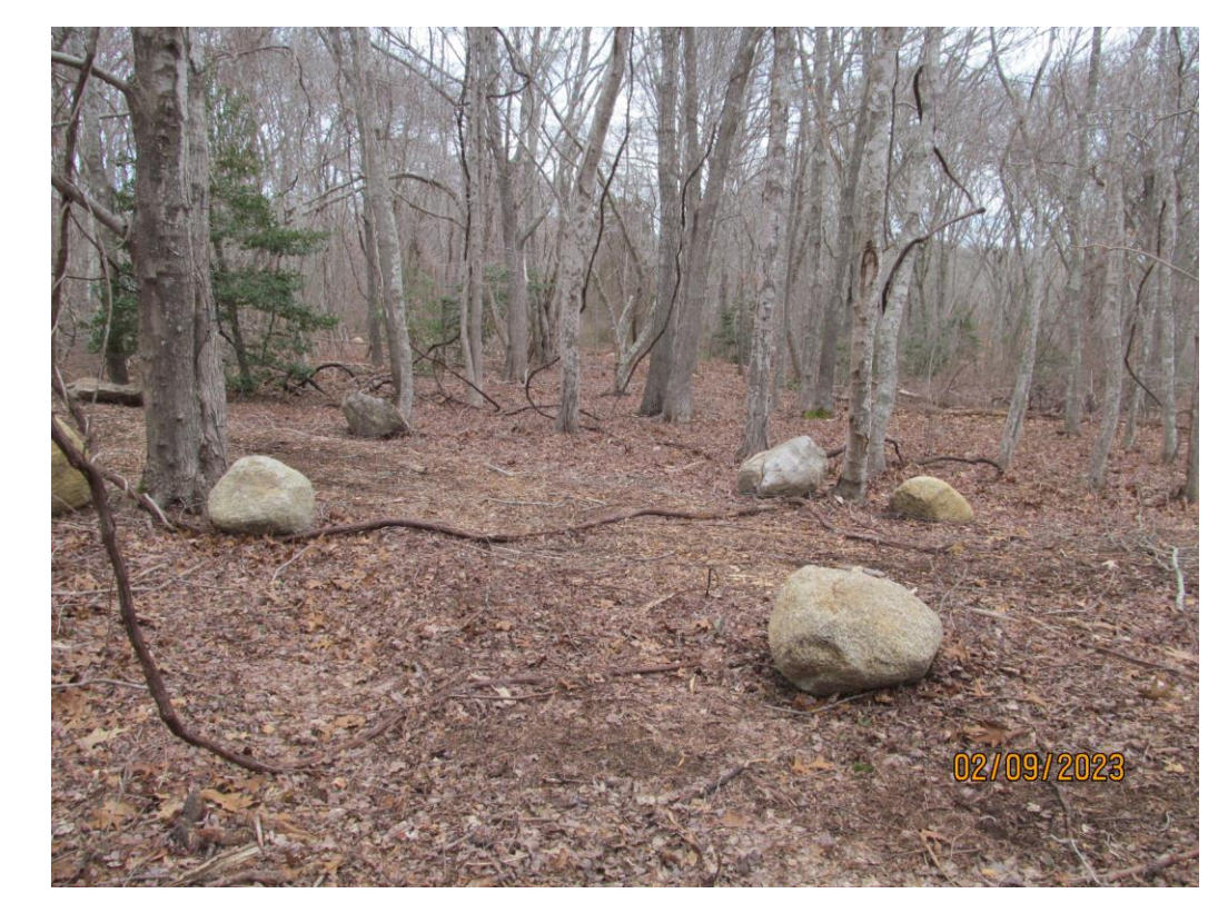
Orange is wetland flag B5. Boulders appear to mark sides of a road