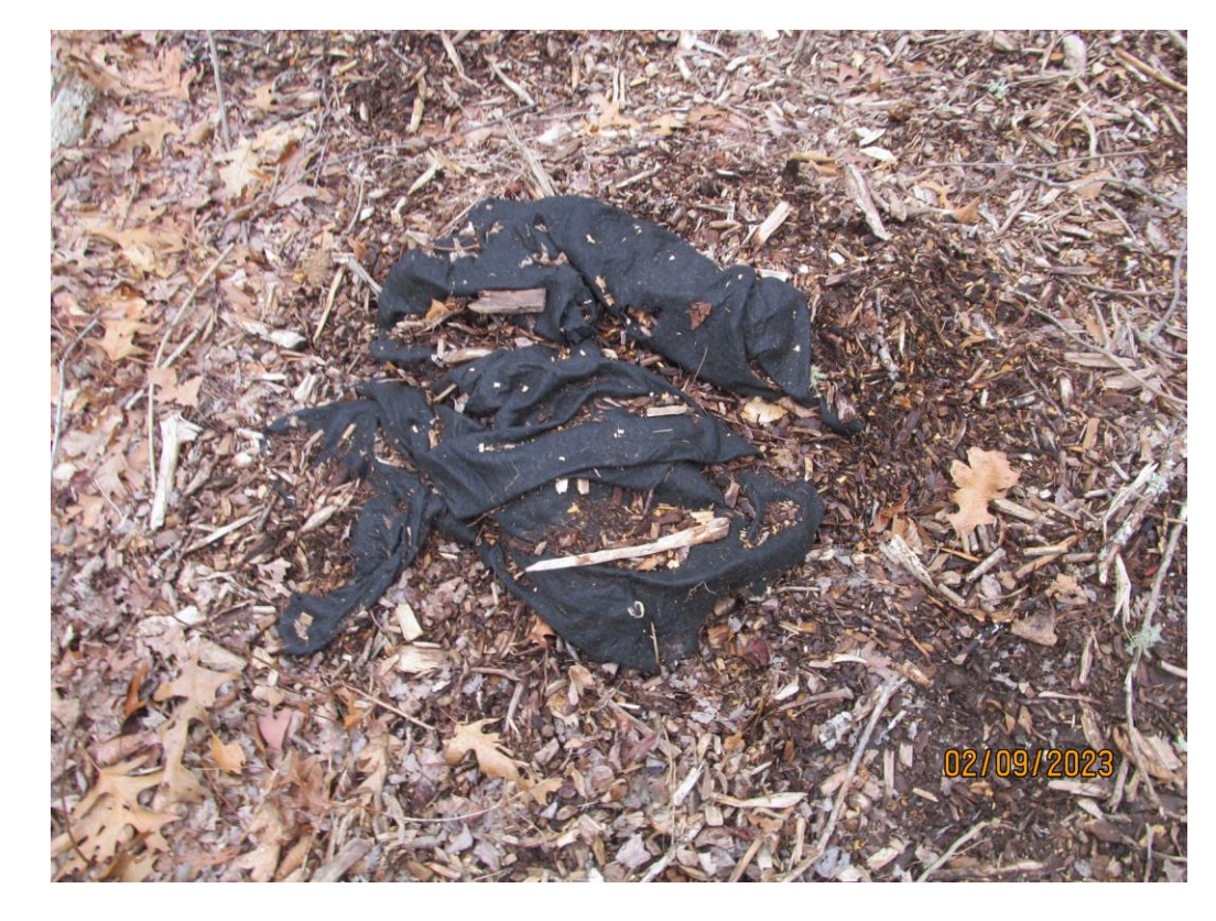
More examples of alteration. Need these areas shown on the site plan to determine whether they are within BZ