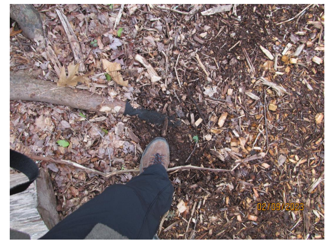
Road area and exposed filter fabric