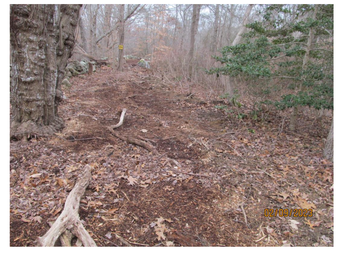
Photo on left is looking toward Indian Hill Road. Need to know if area to the right is within BZ. Same with area shown on photo on the right.