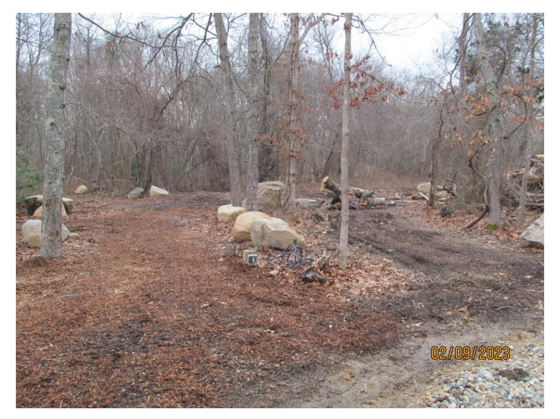
Brush cut areas and new road. Need to know if this is in the BZ