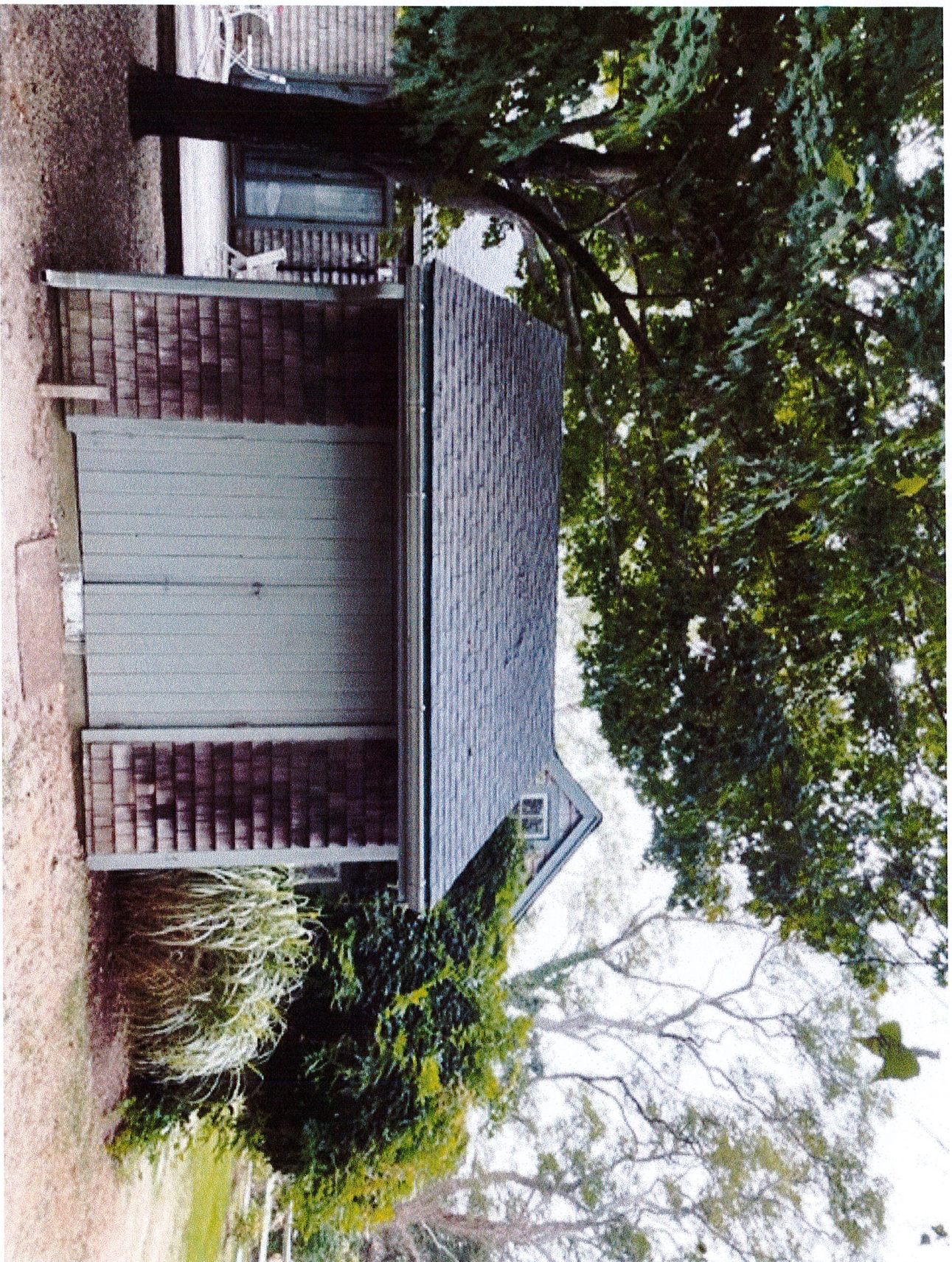
Shed on side of cottage (cannot be seen from street)