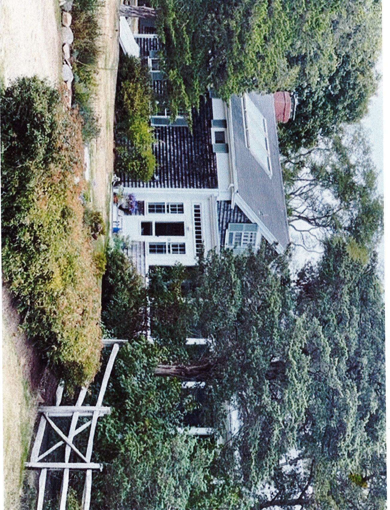
side of main house