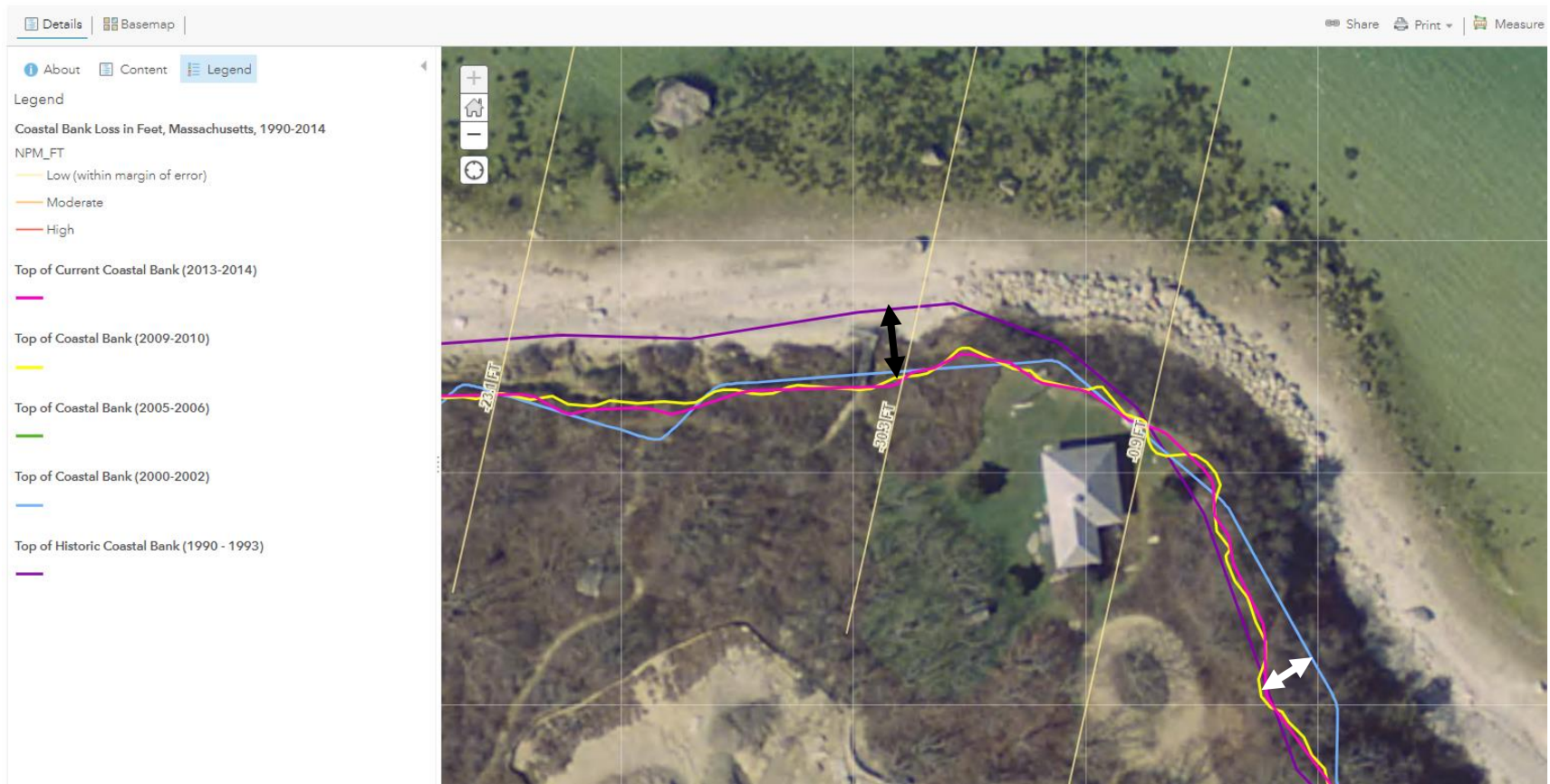
Figure 1. The most critical section of coastal bank erosion and retreat (↔) is located north and west of the cottage, landward of the historic position of the top of bank. The less critical section is located east and south of the cottage, seaward of the historic position of the top of bank, as shown by the white arrow.