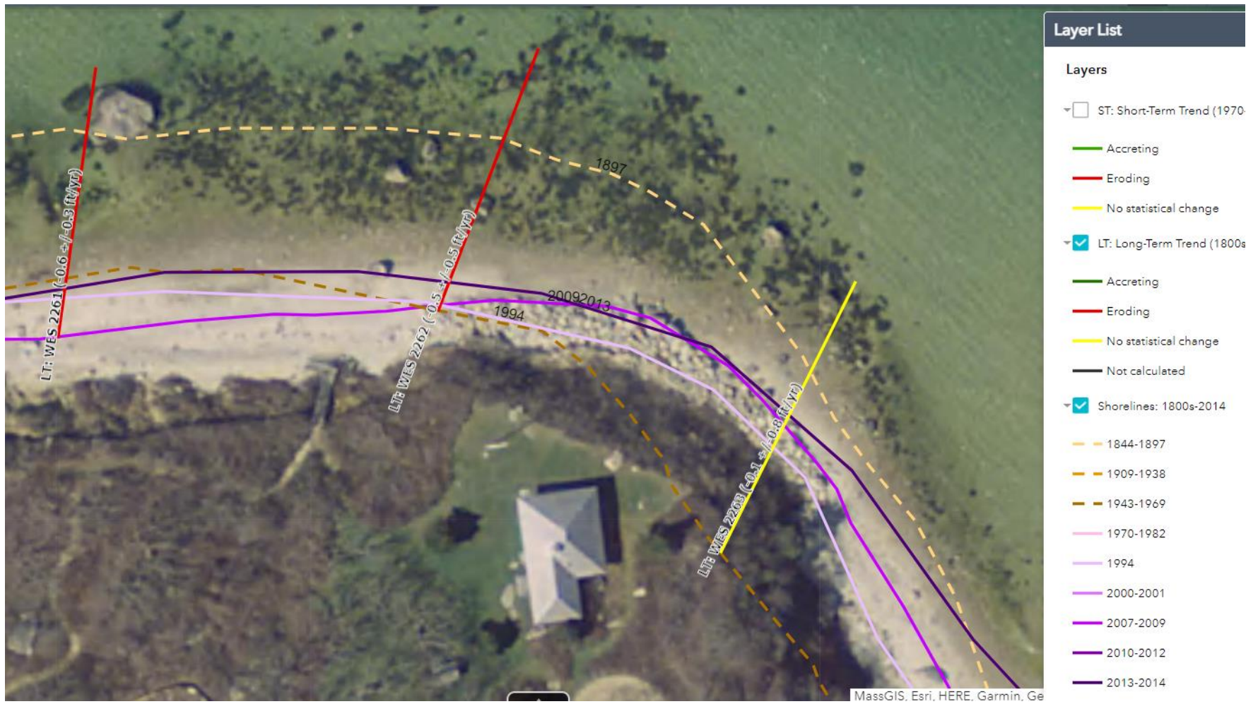
Figure 2. Updated shoreline change mapping by MCZM.