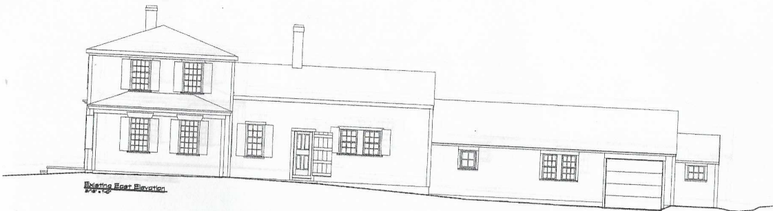
Existing East Elevation 2/24/12