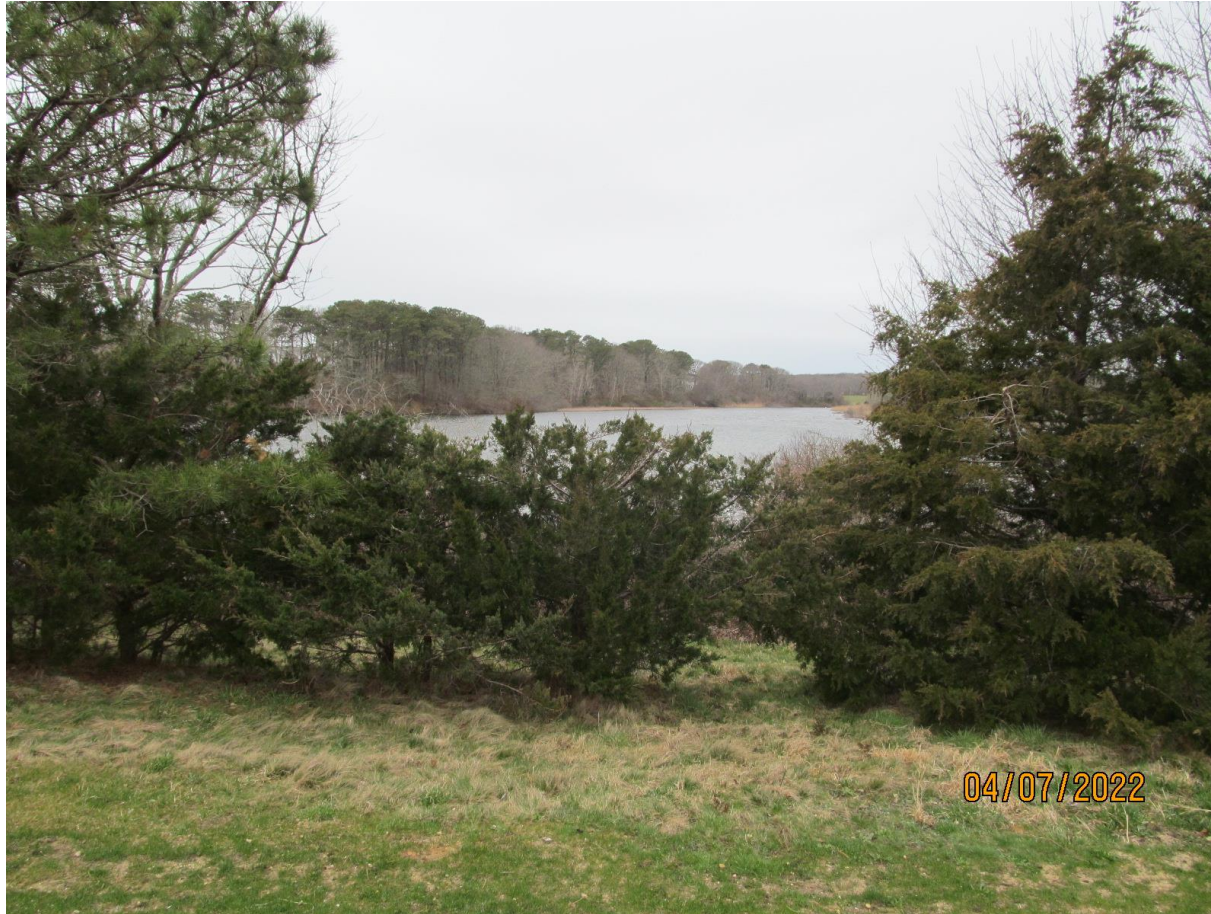
view created by storm damage according to landscaper