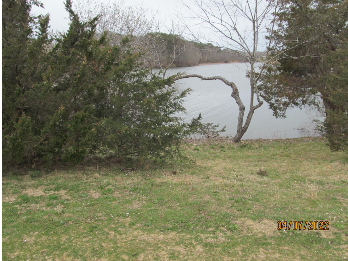
Along the first 25 ft of the BZ and the top of bank