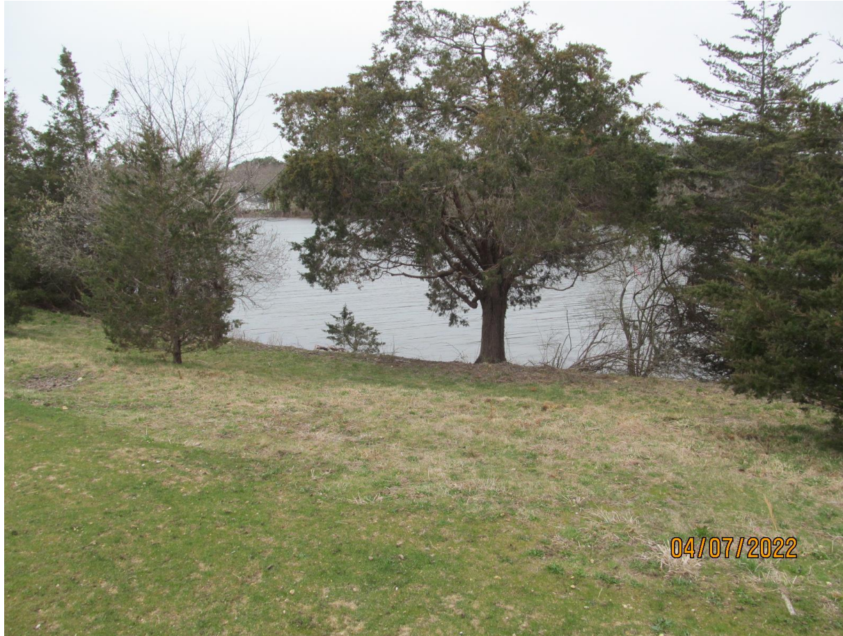
along top of bank