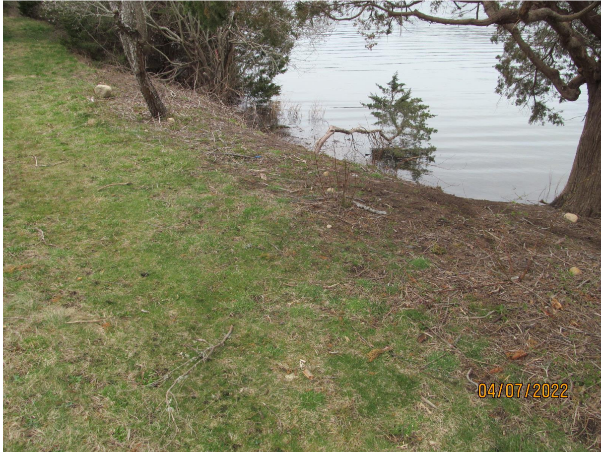
invasive species removal. maybe a little zealous. Good location for boat ramp