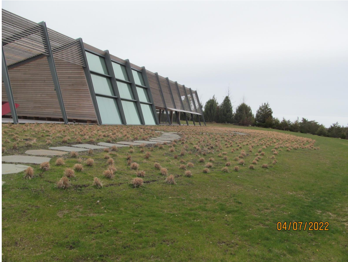
Area of grading and landscaping