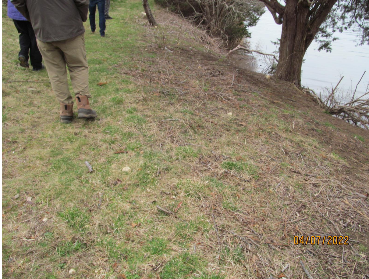
top of bank