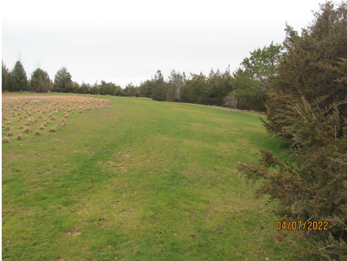
SE79-389 Row of Cedars where invasivise species removal took place