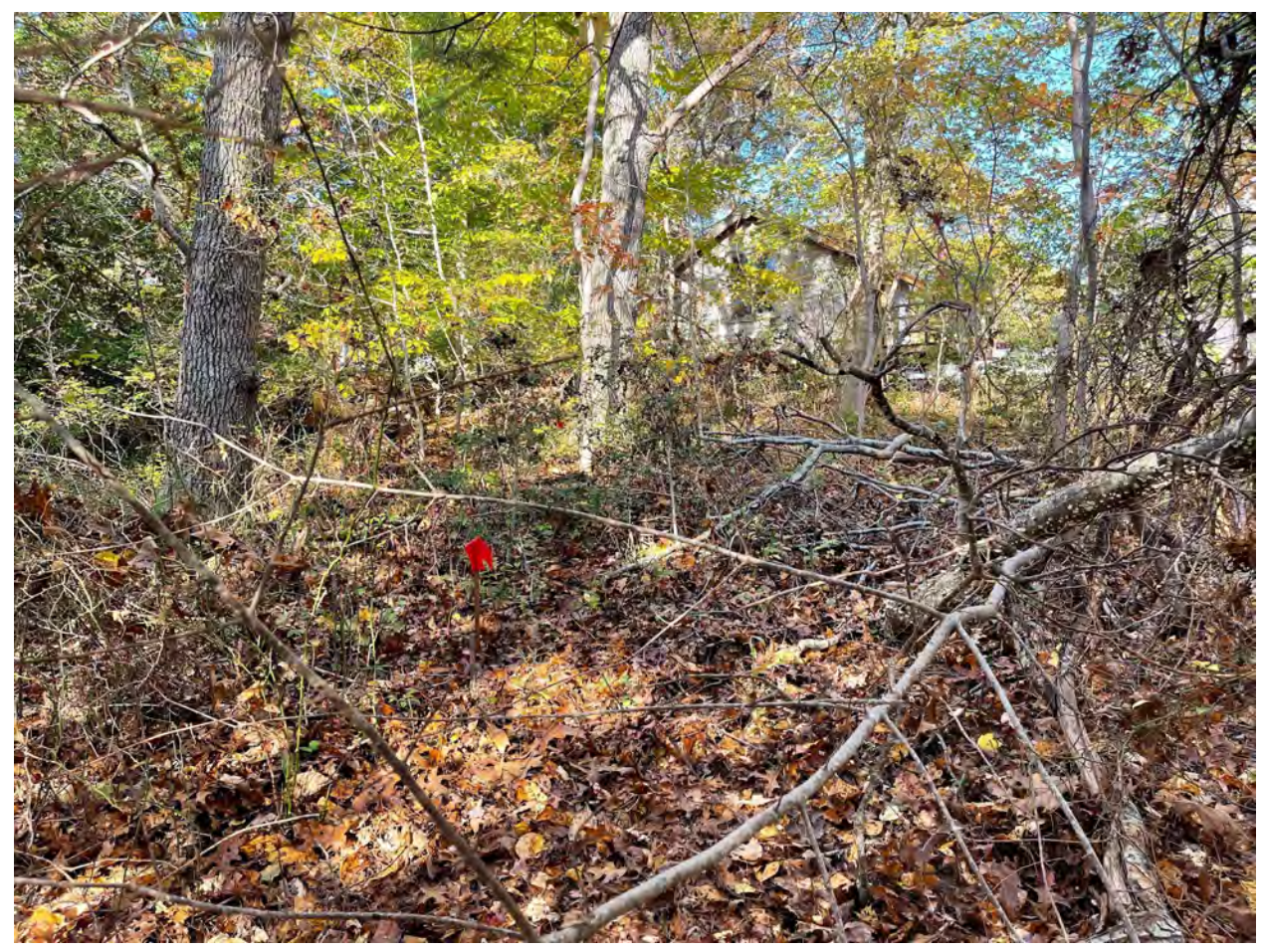
75ft mark (Pickle Shed in view but not my house)