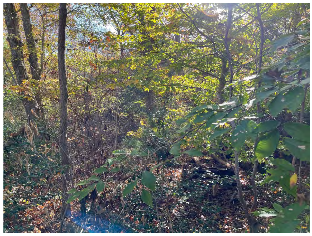
100ft mark from which my house cannot be seen at all.