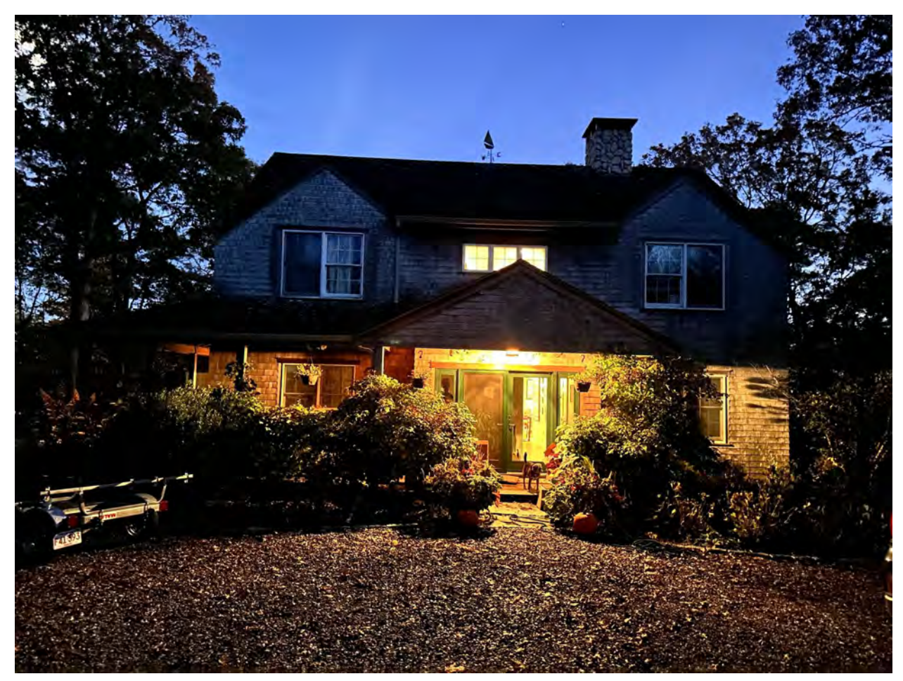
I feel that the lighting on the exterior of my home doesn't even come close to excessive.