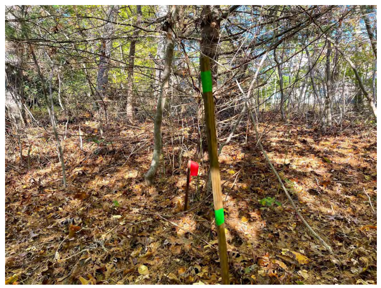
50 ft mark - in view, Pickle Shed, to be moved.

home unless one has walked into the woods and is deliberately trying to see through the trees. Again, please note the photos. As such, this does not seem a reasonable request.