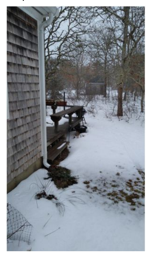
View A - Actual View from 62 Skiffs Lane (Map 17, Parcel 3.7). Abutting shed in view.