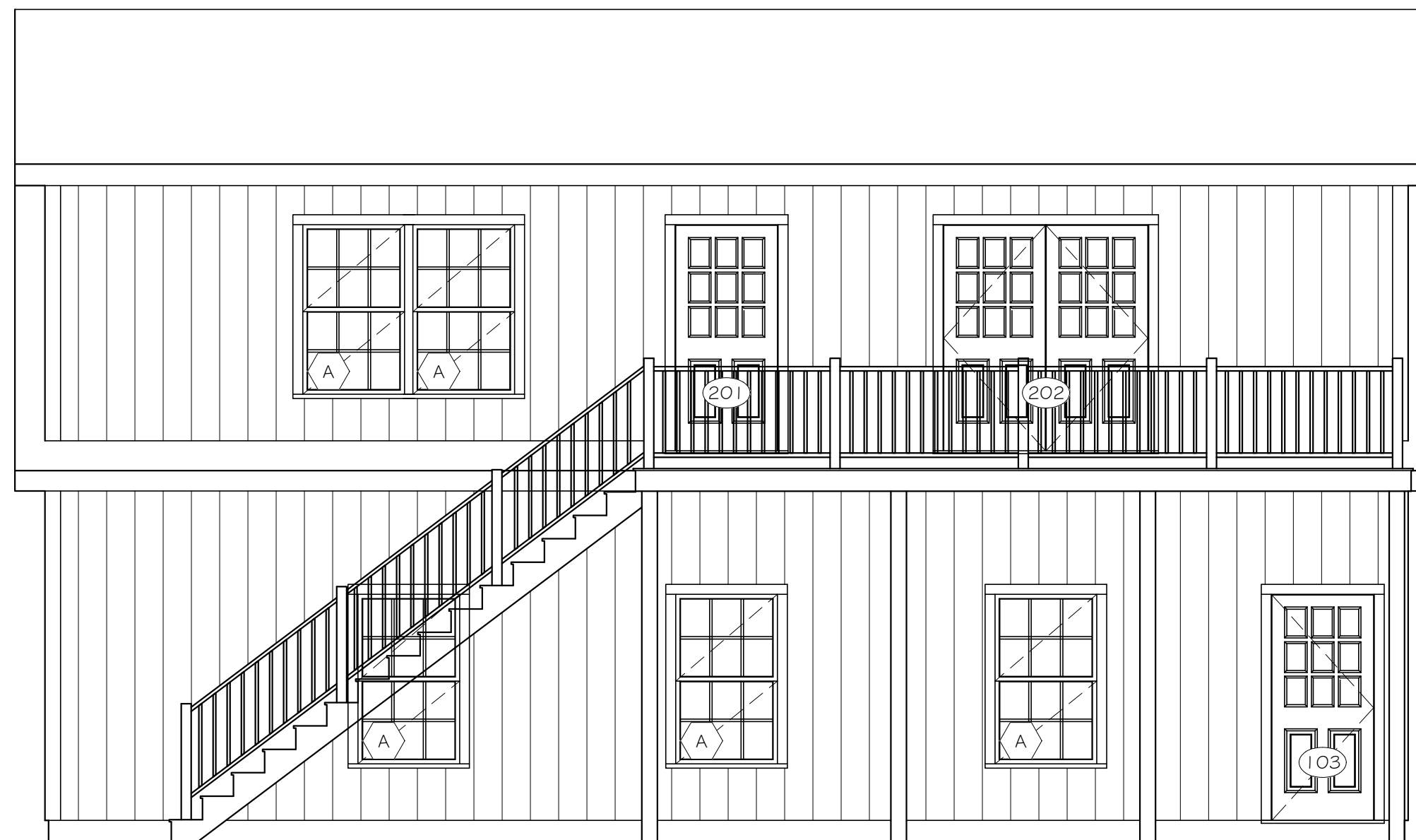
4 SIDE ELEVATION SCALE: 1/4" = 1'-0"