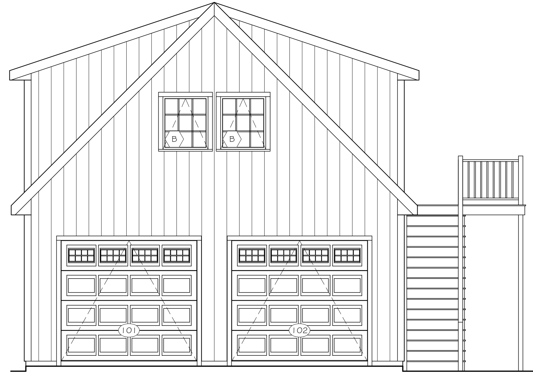
1 FRONT ELEVATION SCALE: 1/4" = 1'-0"