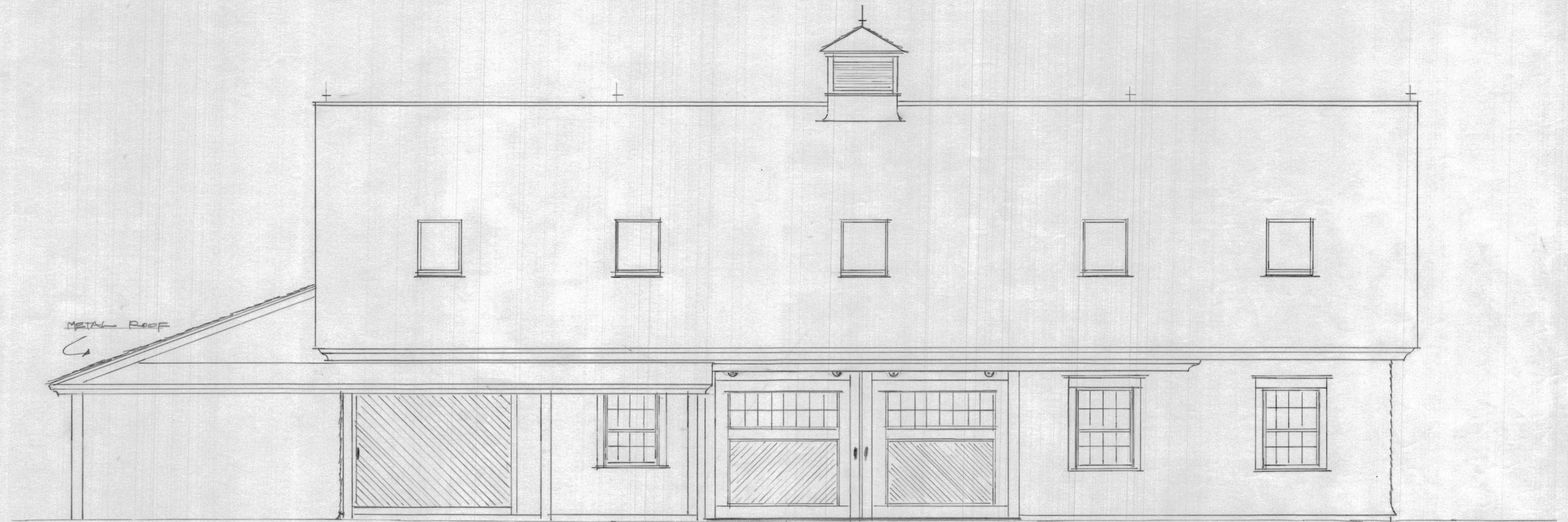
NORTH ELEVATION 1/4" SCALE