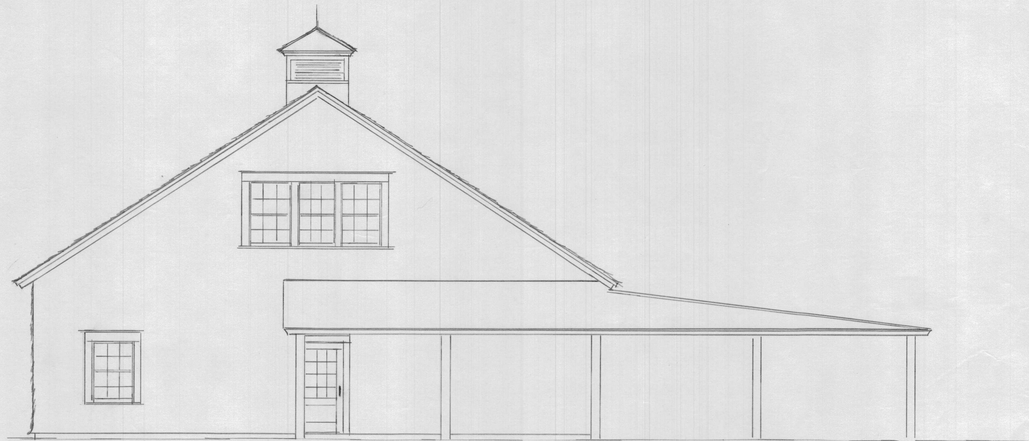
EAST ELEVATION 1/4 SCALE