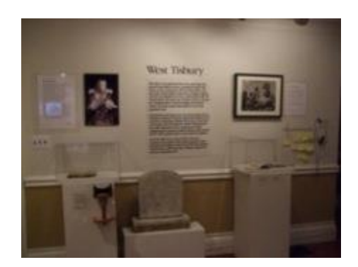
First Congregational Church of West Tisbury